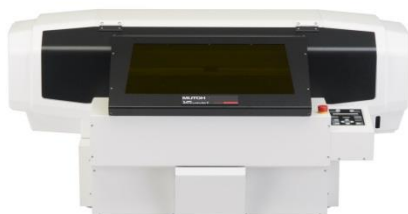
Mutoh VJ 426UF