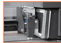
Automatic Media Cutter