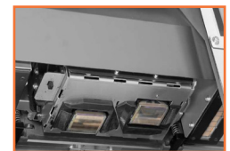
Staggered Dual Print Heads

MUTOH's genuine VerteLith RIP software bundled with FlexiDESIGNER MUTOH Edition 21 optimizes the VJ-1638UR Mark II through these key features: