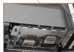
Staggered Dual Print Heads