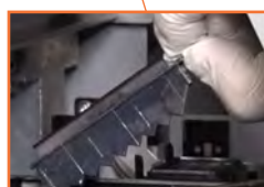
Replaceable Print Wiper