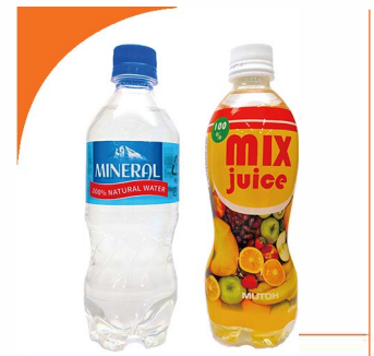
SHRINK WRAP PROOFING