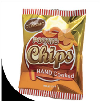
METALLIZED FILM PROOFING

The MUTOH ValueJet 628MP Multi-Purpose Printer is a user-friendly inkjet printer designed to support both 24" wide roll media and sheet media. With multi-purpose "MP31" ink, this printer reliably produces exceptional prints on a wide variety of substrates. MP31 ink is equivalent to eco-solvent ink in weather resistance, abrasion resistance, and color development while providing a smooth, natural finish that brings out the natural appearance of the substrates. Ideally used to produce small-lot gifts, novelty items, package prototypes, stickers, and more, this reliable printer delivers high-quality results. The ValueJet 628MP has an expanded color gamut, supporting up to 8 colors, including light inks or spot-color inks such as orange, blue, and green. More color variety allows for smoother gradation expression and improved gray balance and color adjustment. The MP31 ink has remarkable flexibility- it won't crack even when bent and can be printed and processed on vacuum-formed and shrink-wrapped materials. Whether your focus is on commercial printing, industrial applications, or sign and display projects, this 24" Inkjet Multi-Purpose printer is up to the task. Enhance your printing capabilities with the award-winning MUTOH VerteLith™ RIP Software and a complimentary one-year subscription to SAI Flexi DESIGN MUTOH Edition—a combined value of $1,600. Unlock limitless design potential and embrace the future of printing today.